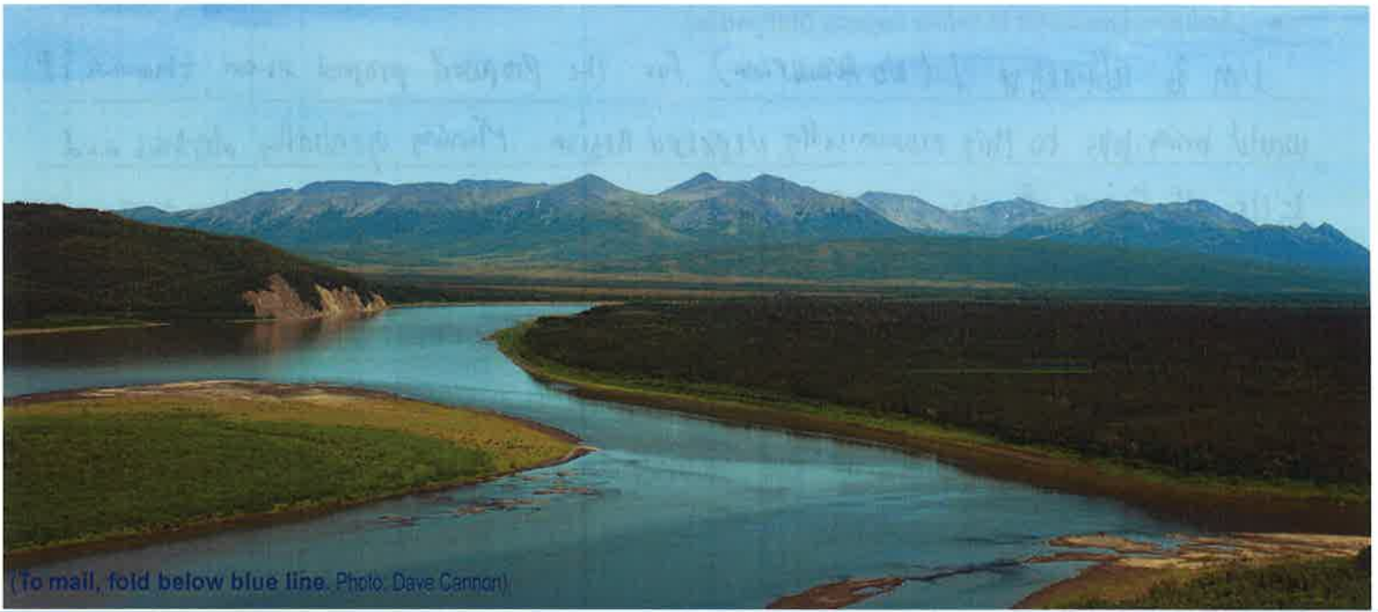
(To mail, fold below blue line.)