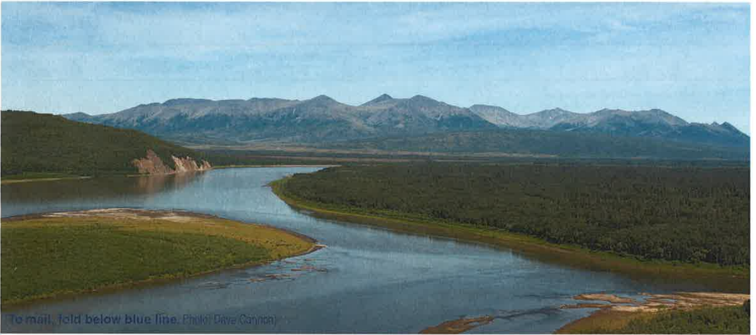
To mail, fold below blue line.