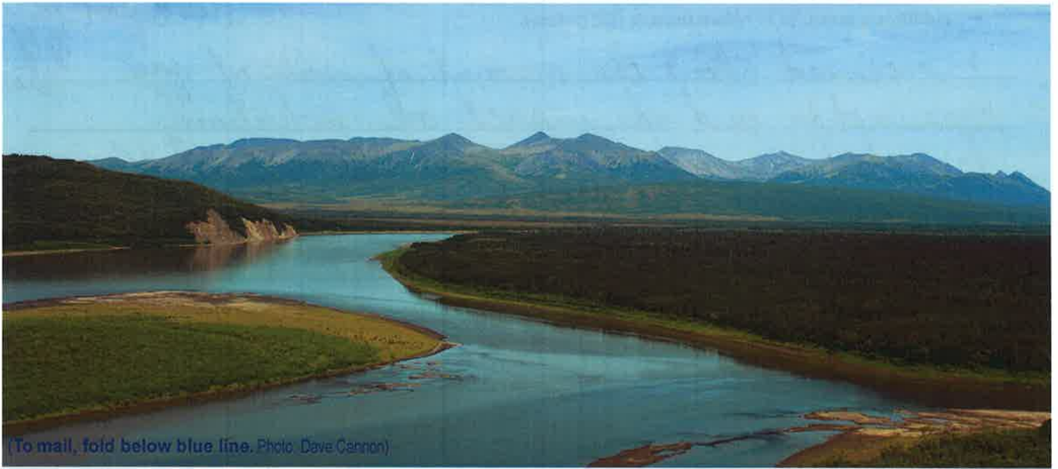
(To mail, fold below blue line.)