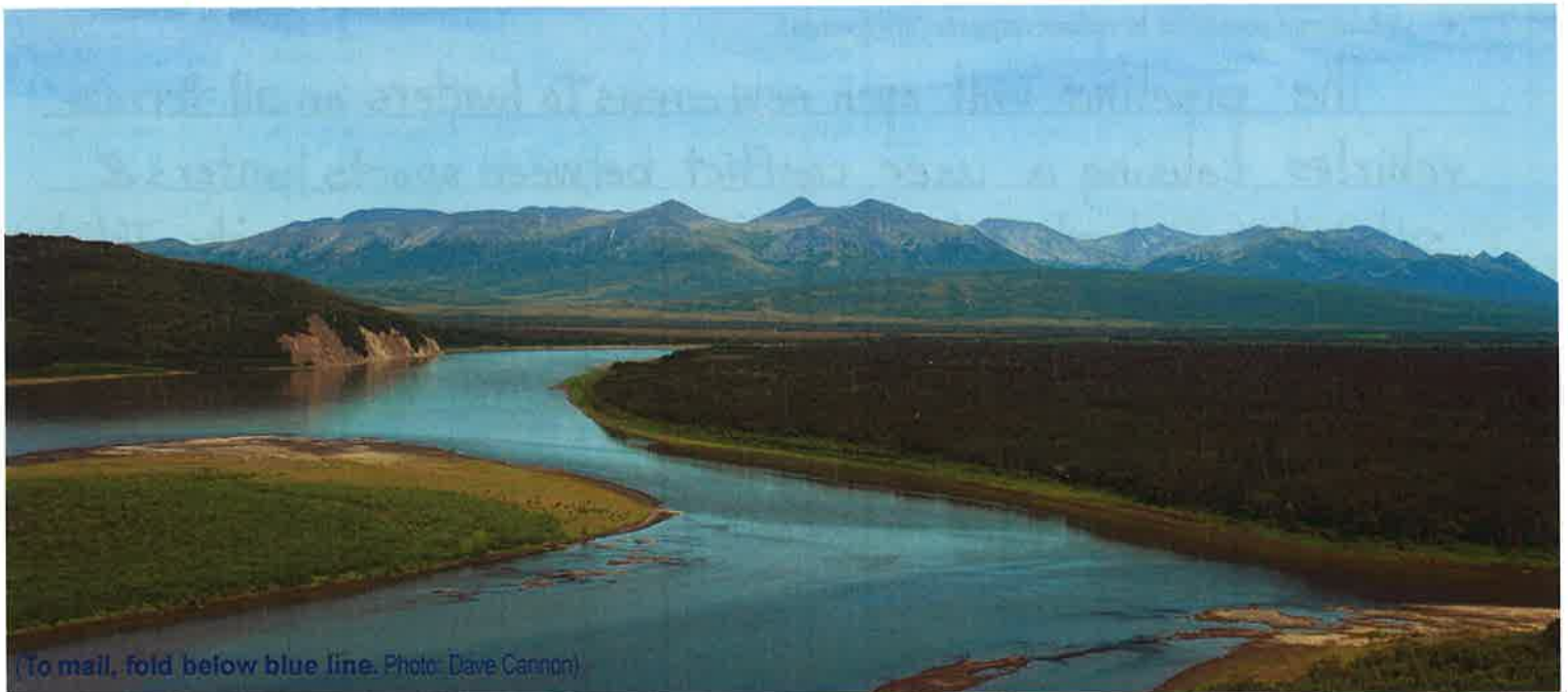
(To mail, fold below blue line.)